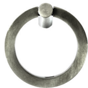
Drop Pull AG W 2 D 1 H 2