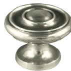
Knob A W 1\frac{1}{16} D 1