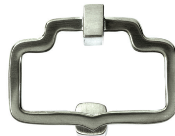
Bail Pull AJ W 3 D \frac{3}{4} H 2\frac{1}{4}