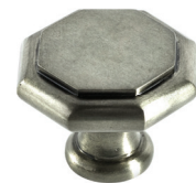
Knob AD W 1\frac{1}{2} D 1\frac{3}{16}