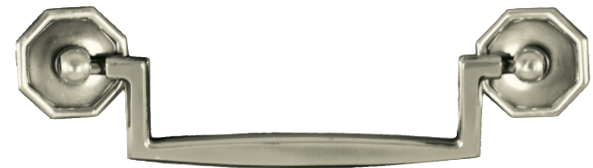
Bail Pull R W 5\frac{3}{4} D \frac{9}{16} H 2\frac{11}{16} (Boring 4\frac{1}{2} )