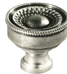
Knob B W 1\frac{1}{16} D 1\frac{1}{8}