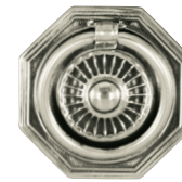
Drop Pull K W 1\frac{7}{8} D \frac{5}{16} H 1\frac{7}{8}