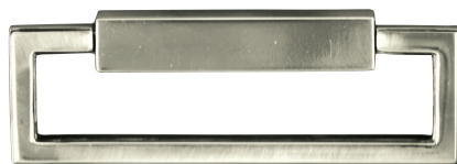
Bail Pull S W 3\frac{15}{16} D \frac{1}{2} H 1\frac{1}{4} (Boring 1\frac{1}{2} )