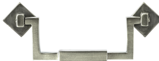
Bail Pull AH W 5\frac{1}{2} D \frac{5}{8} H 4\frac{1}{4} (Boring 4\frac{1}{4} )