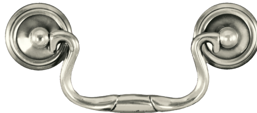
Bail Pull P W 4\frac{3}{4} D \frac{9}{16} H 2 (Boring 3\frac{1}{2} )