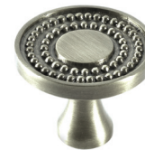
Knob AE W 1\frac{9}{16} D 1\frac{1}{4}