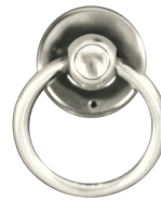
Drop Pull H W 1\frac{3}{4} D 1\frac{11}{16} H 2\frac{3}{16}