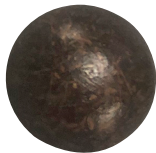
NL-04 Aged Antique brown and black flecks with a worn, aged look