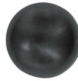
NL-10 Black Pearl a blue-black finish