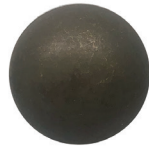
NL-05 Natural matte, greenish brown finish