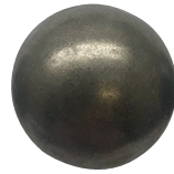
NL-09 Antique Nickel an antiqued silver finish